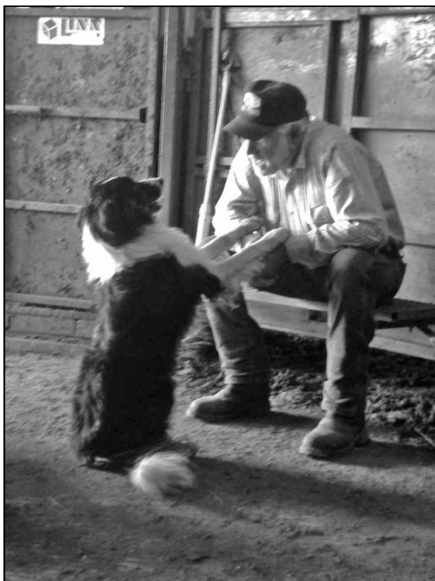
Photo taken, candidly, by Megan after a long day of working bulls. Roper isn't ready to quit... ever!

Look at this combo! Out of a 1st-calf heifer by New Standard! Double-bred GridMaker—triple-bred 066! This bull will come along—he will grow up and be very impressive six months from now. And he'll sire pounds.