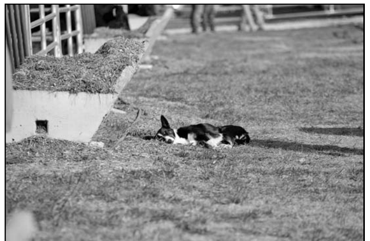
Marley tends to stay a little more relaxed at sale time!

Nice bull—bred very similar to all of the previous Net Present Value sons. Calving ease and still a good kind.