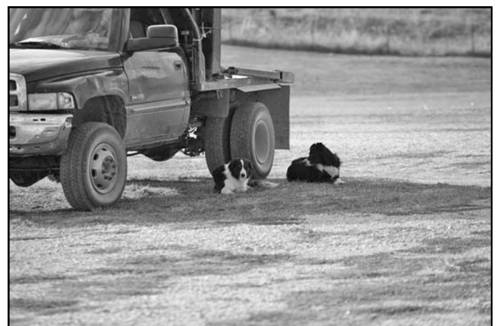
Skunk and Roper. Man’s best friends—always there and always ready to work!