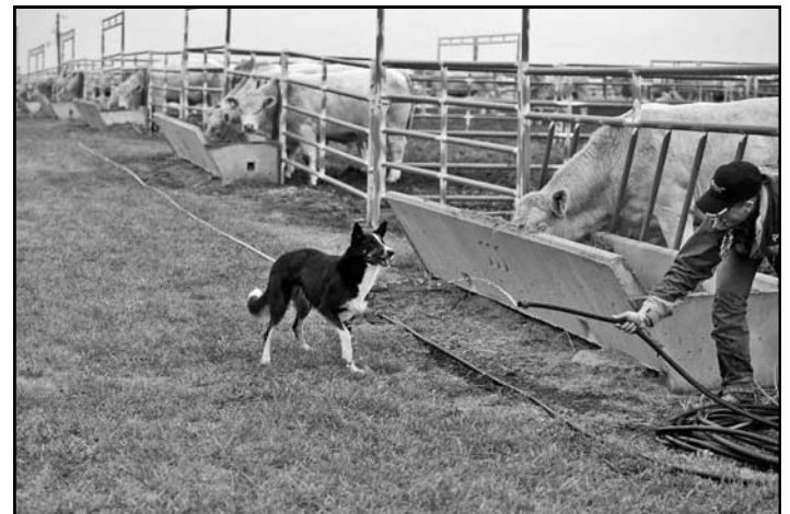
Marley supervises all watering.

Triple bred 5522. More producers are analyzing chasing extremes in any breed of cattle — the true cost — of cows that last 5 or less years, have bad feet, bad udders (if they bred every year). Look at the total costs.